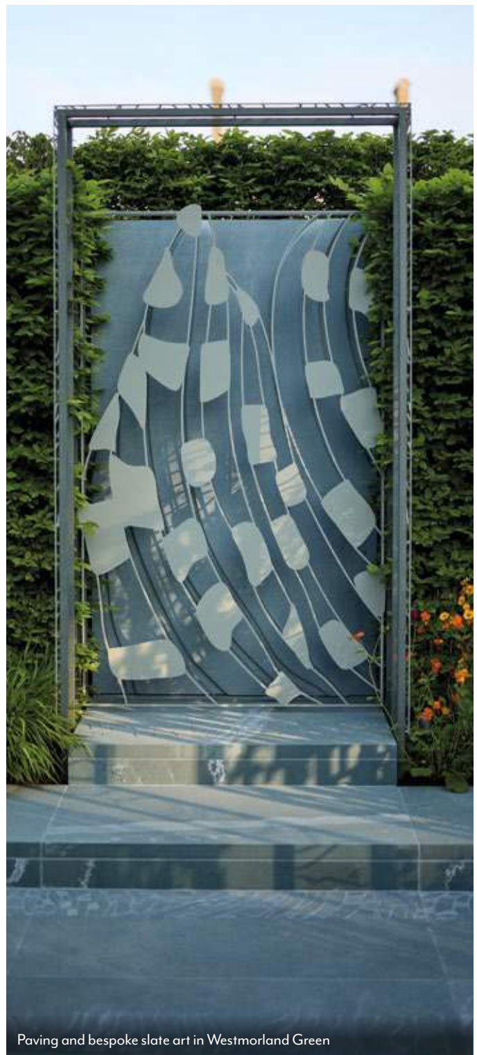
Paving and bespoke slate art in Westmorland Green