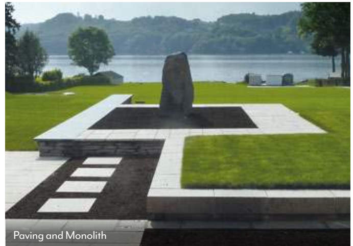
Paving and Monolith