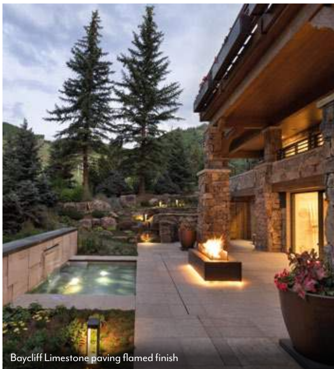
Baycliff Limestone paving flamed finish