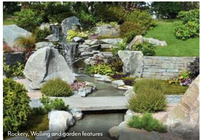
Rockery, Walling and garden features