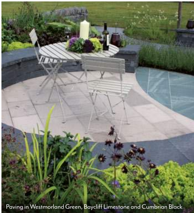
Paving in Westmorland Green, Baycliff Limestone and Cumbrian Black