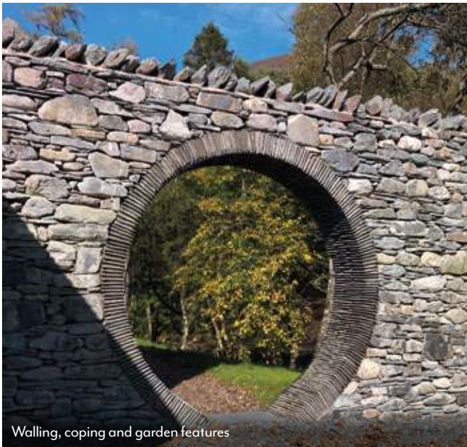
Walling, coping and garden features